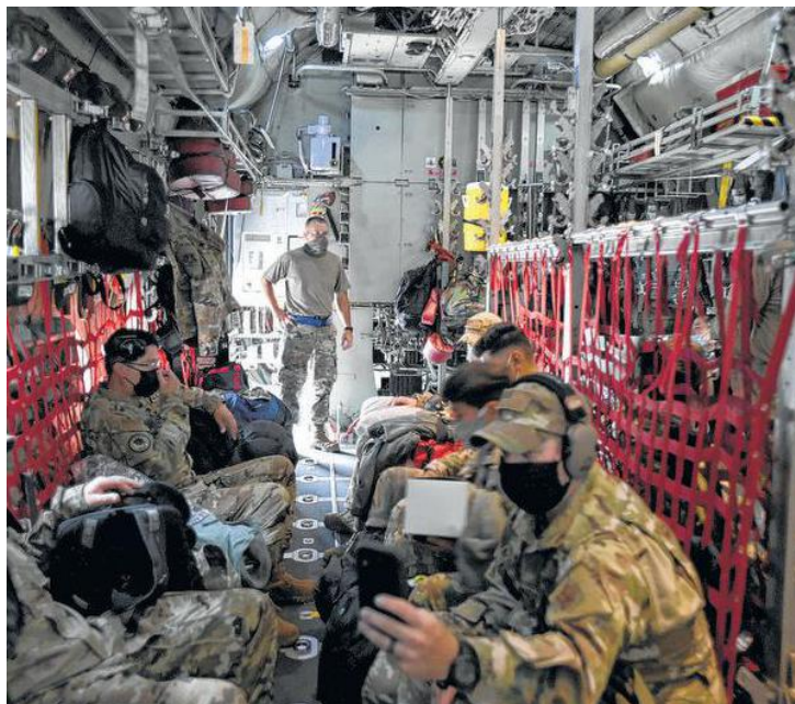
433rd Civil Engineer Squadron firefighters get settled aboard a C-130H Hercules cargo aircraft June 28 at Joint Base San Antonio-Lackland, on their way to Southwest Asia to perform fire protection duties.